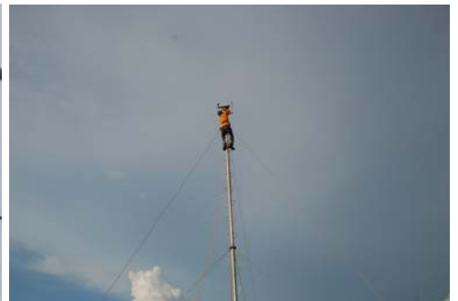
Instalation of Weather Station tower camp MRPP