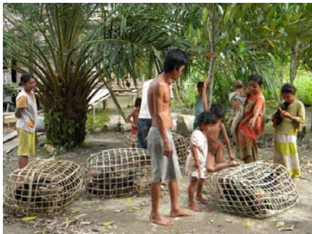
Tembesu Rangers received 3rd batch of chicken