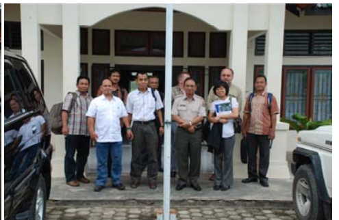
MRPP and ZSL Meeting 19/01/2010