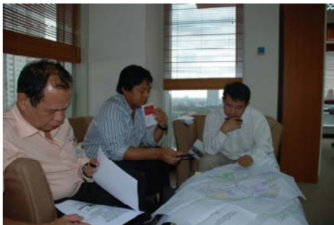
Meeting EcoSecurities 21/01/2010