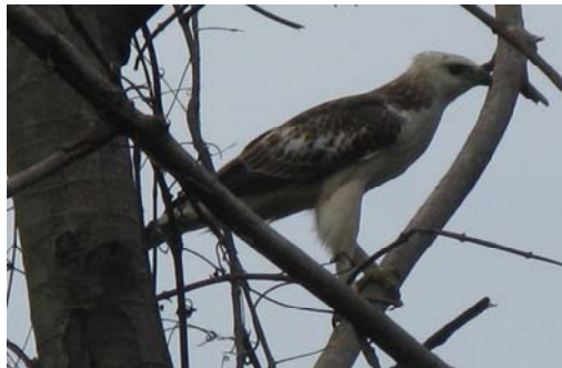
Change-able Hawk-Eagle ( Spizaetus cirrhatus )