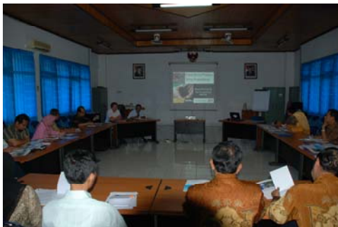
Biochar Workshop 19/02/2010